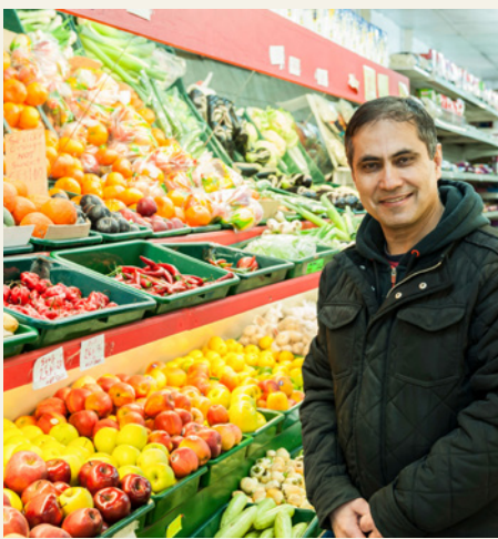
Harrow Council | Page 11