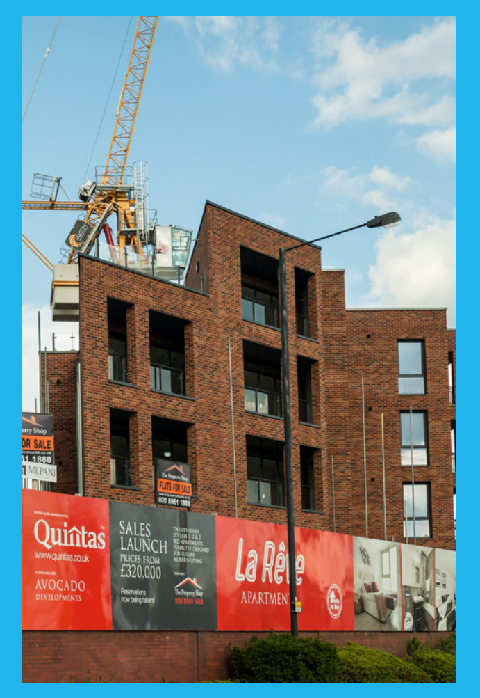
Harrow Council | Page 13

The necessary financial resources and proven ability to finance developments of similar scale and nature.